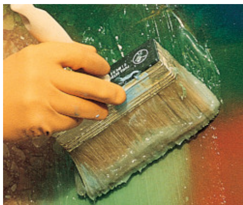
Applying WallGard Graffiti Remover Gel with a brush

Repeat the operation if the results are unsatisfactory. Rinse the treated surface thoroughly with water.