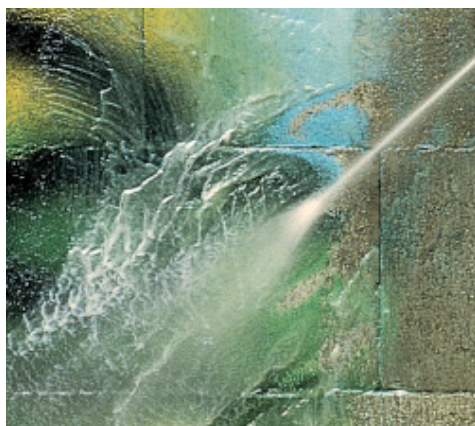
Using a high-pressure cleaner