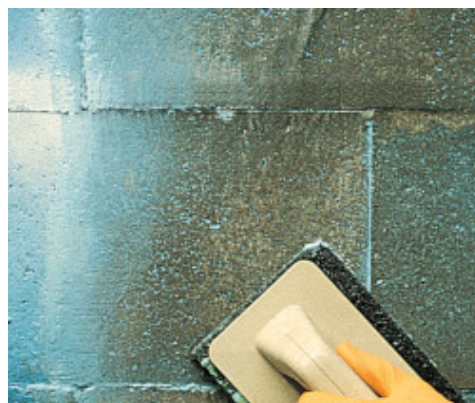
Cleaning with an abrasive pad