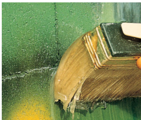
Applying WallGard Graffiti Remover Gel with a brush